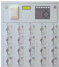
Figure 1 Module for 20 safe-boxes

Unit UK 20 (figure 1) constitutes the base of the entire system. The module controls the entire set, enabling connection to the electronic security system and the computer with visualization for on-line transmission of events, e.g. to the supervisor, receptionist or controller. The maximum number of safe-boxes is 20 where safe-deposit vault, important room-door and storage room keys or mobile telephones can be deposited while one enters premises requiring high level of security and secrecy. Each user is assigned a selected number of boxes and the time period in which he can handle them (chart 1).